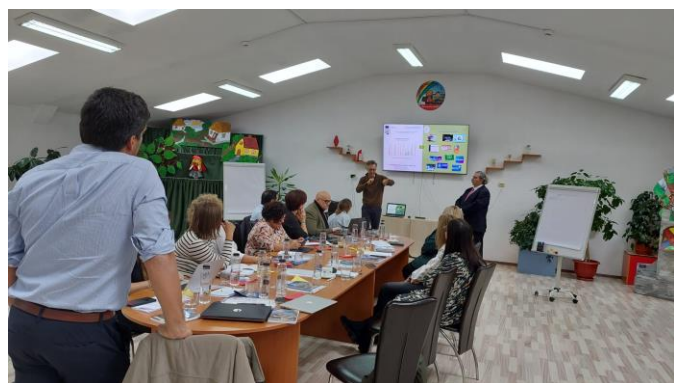
Figure 1. Presentation of the results of local workshops

Within the workshops conducted by CEPISS (Italy) , 9 teachers participated, and 88.9% of the participants appreciated that their digital skills and knowledge experienced significant progress.