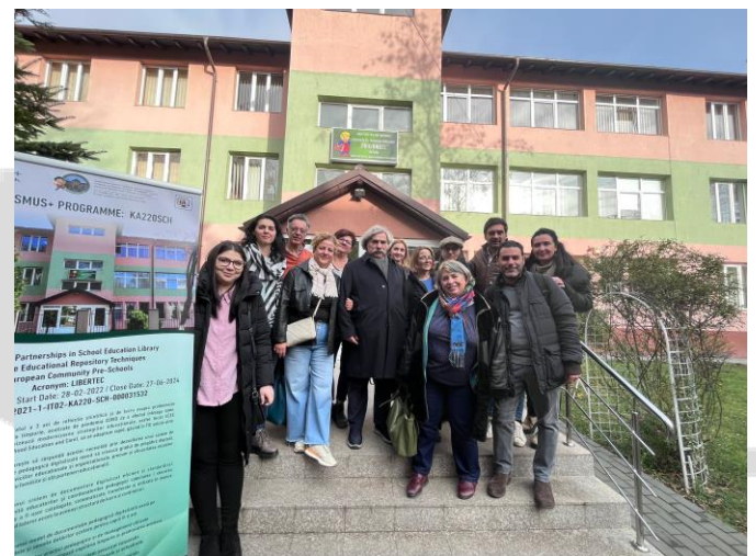
Figure 5. Participants of the 3 rd TPM

In conclusion, these two sessions were extremely important for the progress of the LIBERTEC project. Active participation in these discussions and commitment to the LIBERTEC project are fundamental for achieving common objectives.