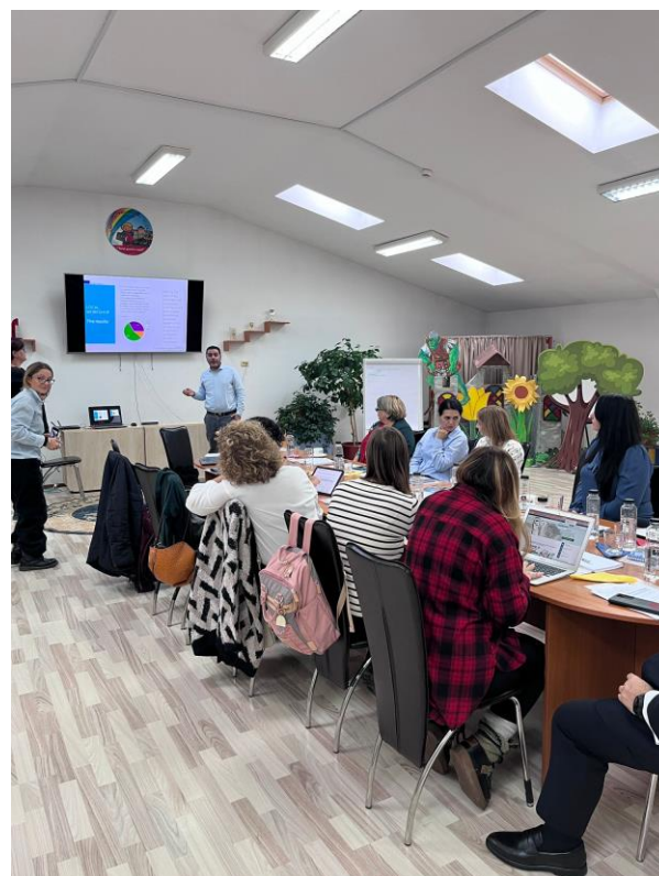
Figure 2. Presentation of the results of the local workshops

There were also moments for the exchange of ideas and collaborative learning among educators from different European countries, as well as suggestions for improving the presented Guidelines.