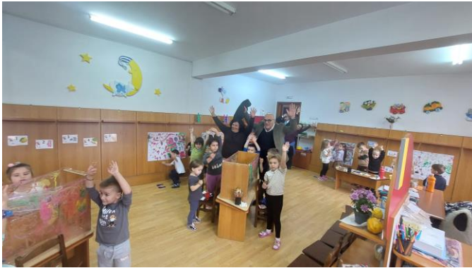
Figures 3 and 4. Visit GPP Prichindel

The implementation of digital methodologies in early education is a priority in this project. LIBERTEC strives to strengthen early education through the efficient use of digital resources and innovative practices.