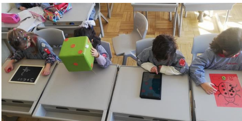
Fig. 1 – Using hybrid strategies when doing learning activities

In what matters to digital tested educational apps with children, the educators from P and nP groups opted to use hybrid strategies when doing learning activities, because at these ages (0 to 6) is very important stimulate all the body senses for a crucial human development (fig. 1).